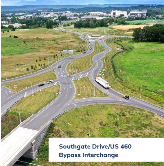
Southgate Drive/US 460 Bypass Interchange

*** Listings in teal are awards that others on a project we worked on won, but we did not directly apply for or receive ***